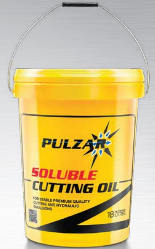
PULZAR SOLUBLE CUTTING OIL Cutting Oil for Sawing, Milling, Turning, Grinding and Drilling Operation