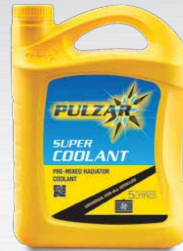
PULZAR SUPER COOLANT Superior Pre-Mixed Radiator Coolant