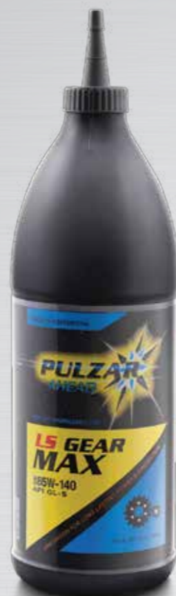
PULZAR LS GEAR MAX SAE 80W-90, SAE 85W-140 API GL-5 High-Performance Multi-Grade Limited Slip Gear Lubricant